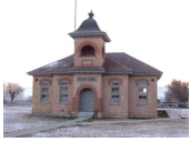
Fairfield School House, 1898